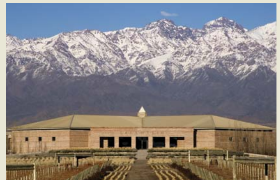
Salentein Winery, Argentina